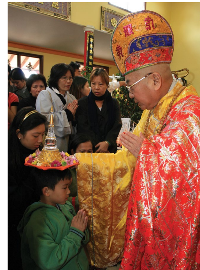
The Most Venerable Thich Nhu Hue gives Relic Blessing at Phap Hoa, Adelaide.