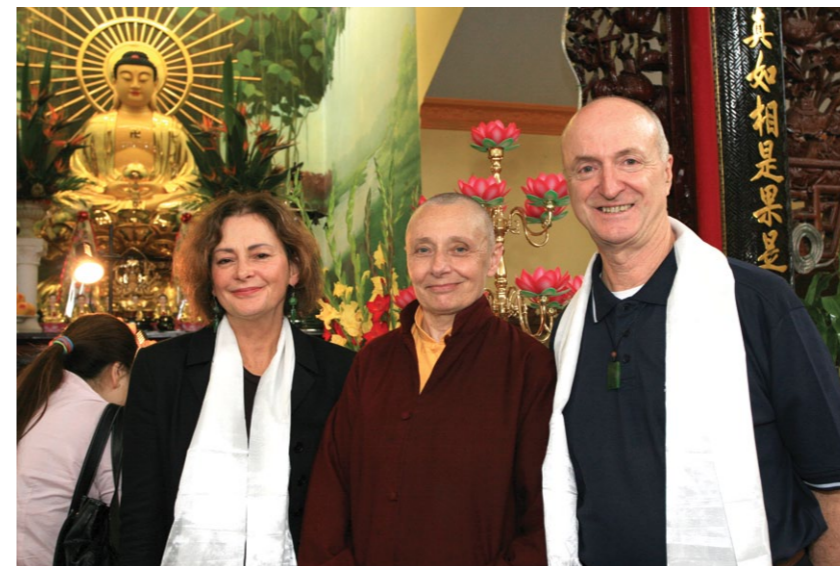
Jetsunma Tenzin Palmo was an honoured guest at the Adelaide Holy Relics Tour.